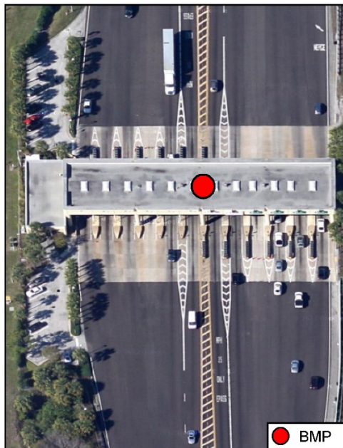
Toll Plaza with Combined ORT Composite